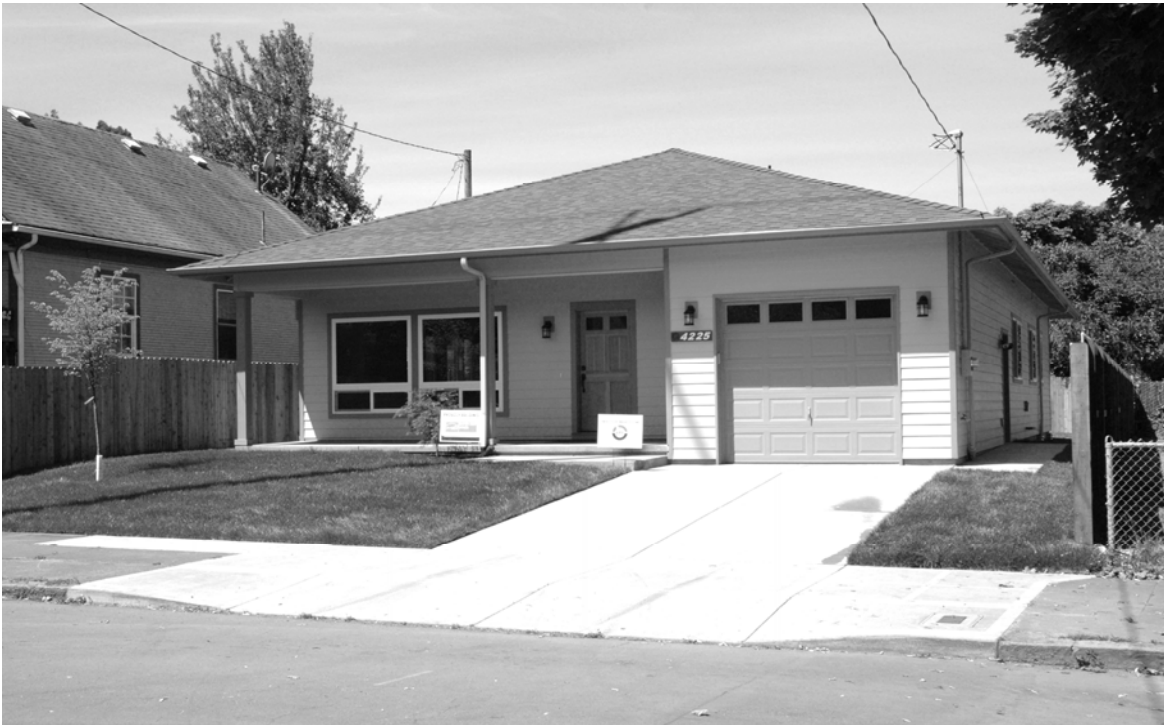
Benson House Projects- Mallory House

At Portland Public Schools, this is our goal: By the end of elementary, middle, and high school, every student by name will meet or exceed academic standards and will be fully prepared to make productive life decisions. Portland Public Schools is an equal opportunity educator and employer.